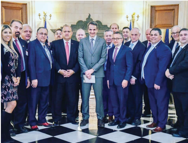
Joint delegation members meeting with Prime Minister Kyriakos Mitsotakis

in conjunction with the private sector, must contribute substance to the groundwork to yield additional actions and concrete results.