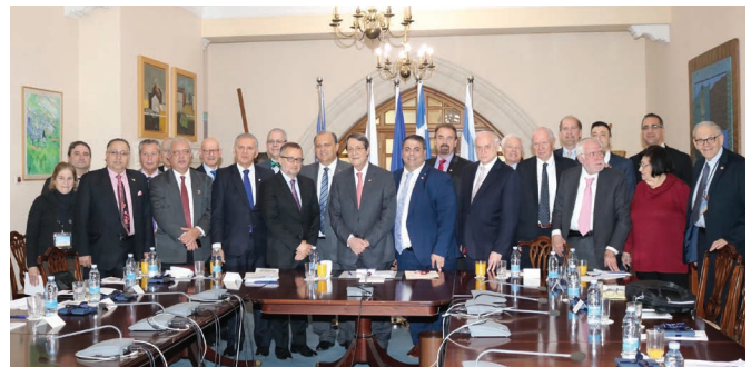
Joint Delegation members meeting with the President of Cyprus, Nicos Anastasiades, at the Presidential Palace

A 22-member delegation of leaders of the American Hellenic and American Jewish organizations completed a fourth, three-country Leadership Mission to Greece, Cyprus and Israel, to explore the major political, economic and security developments underway in the Eastern Mediterranean and to advance the interests of the United States in the region. Meetings were held with more than 30 high-ranking government and military officials and policy analysts from the three countries and the United States between January 11 and 17, 2020. The participating organizations included: the AHI, the American Hellenic Educational Progressive Association (Order of AHEPA), B'nai B'rith International, and the Conference of Presidents of Major American Jewish Organizations.